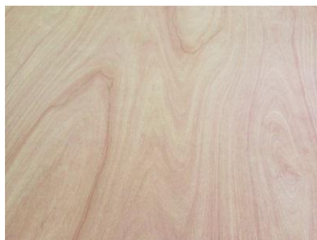
Pencil Cedar / Meranti